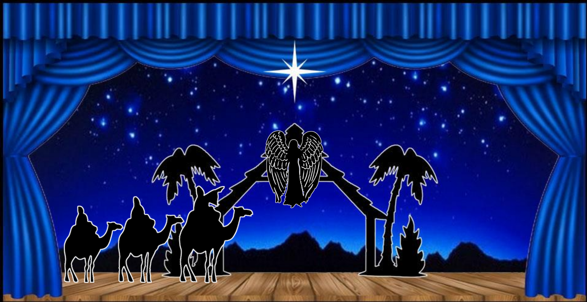
The wise men from the east