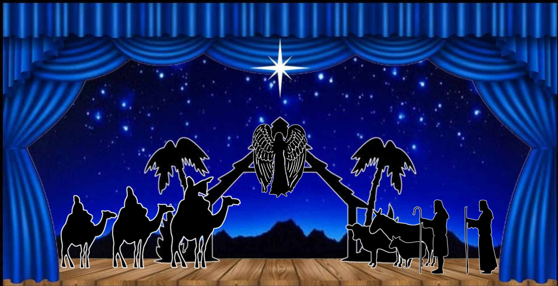
The shepherds of the field and the barnyard animals