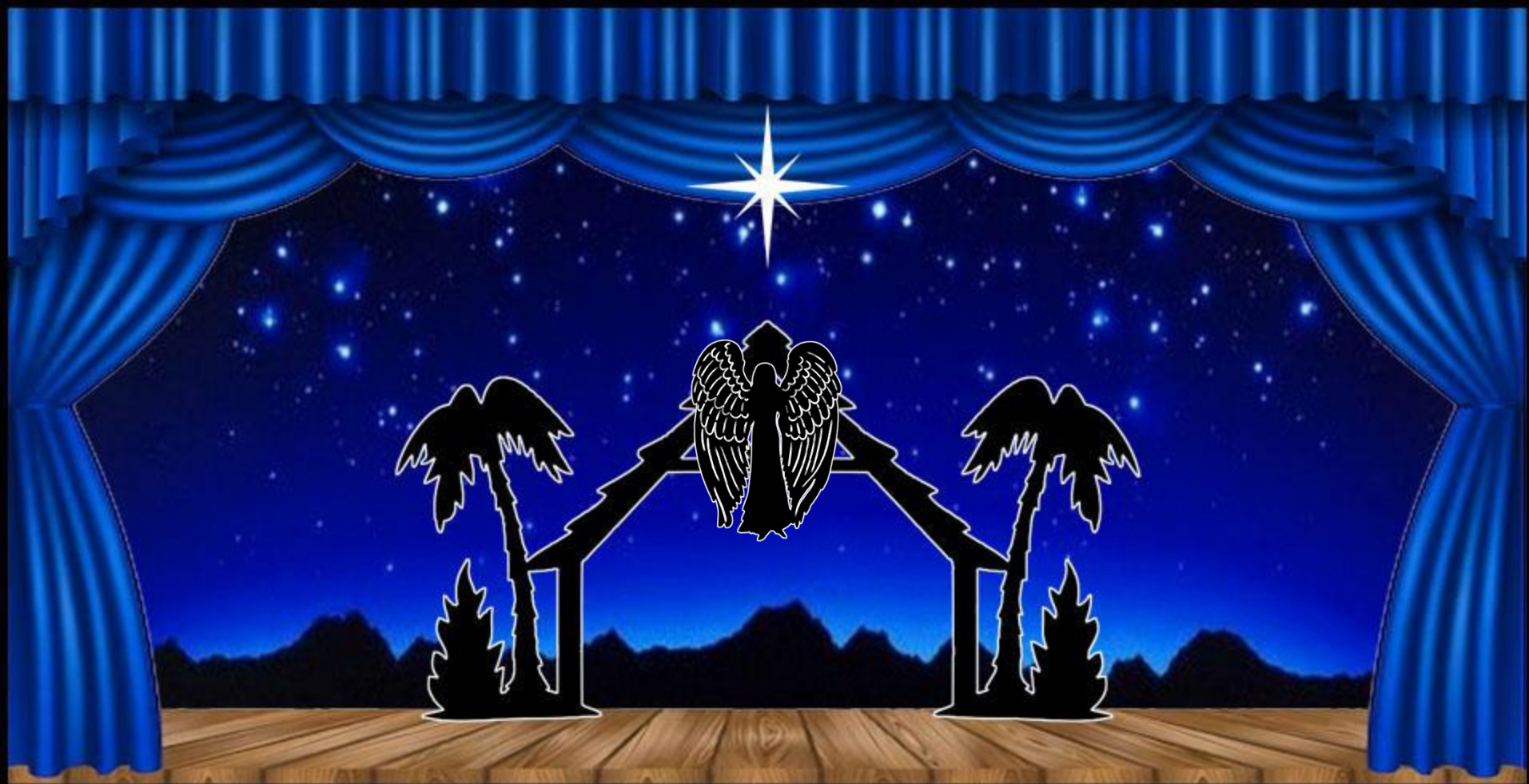
The angel Gabriel