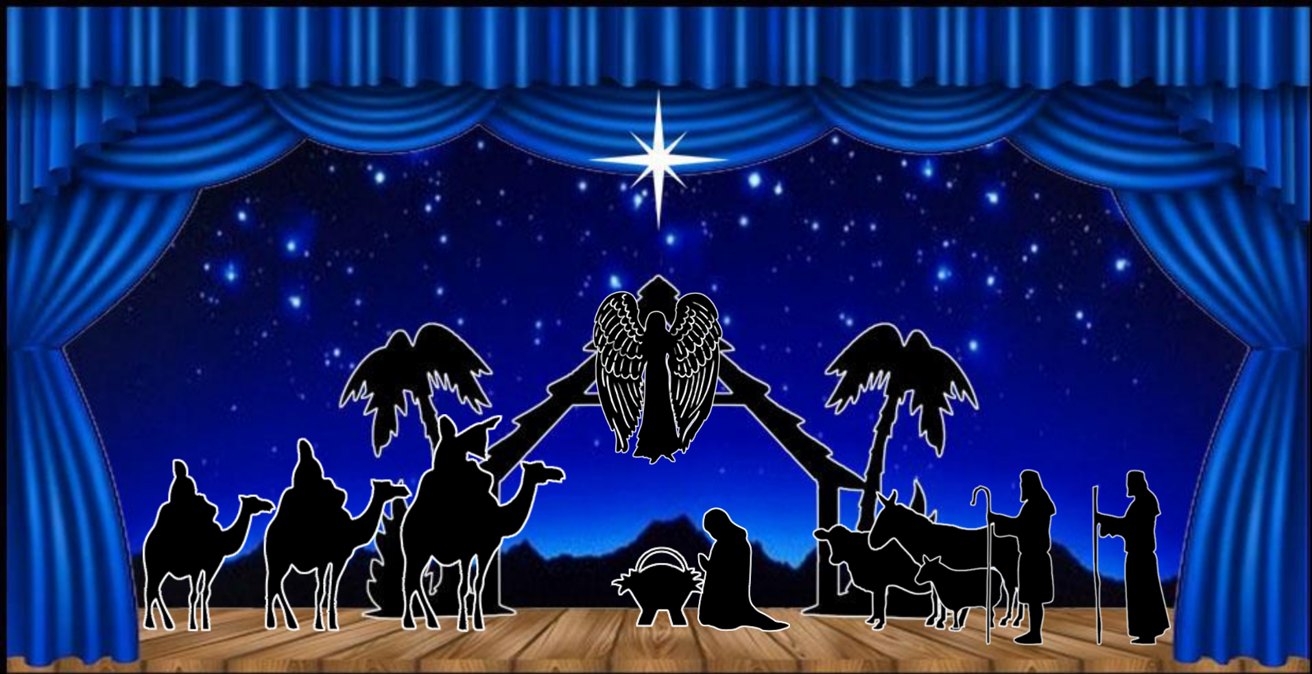
The Virgin and her child